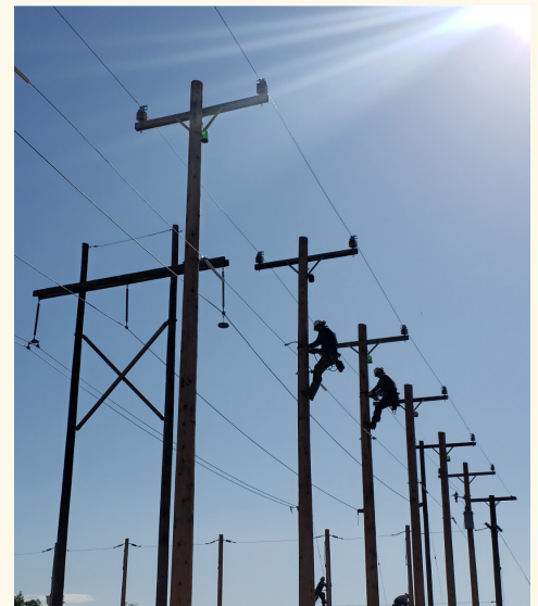
Linemen compete at the 28th Annual Utah Lineman's Rodeo in West Valley City, Utah.

A fun day ended with the banquet which included a social hour, dinner, program, live and silent auctions, and competition awards. Congratulations to the winners and to each of the participants!